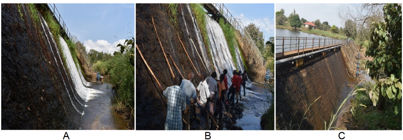
Figure 1. (A) Before “slash and clear” in November 2019, (B) during “slash and clear” at the Maridi dam spillway, and (C) post-“slash and clear” at the Maridi dam, December 2019.

Maridi County is situated in Western Equatoria State of South Sudan, and its main river is the Maridi River (known as the River Gel further downstream). The study area was extensively described in a previous publication [9]. Community-directed treatment with ivermectin (CDTI) coverage in the study villages was estimated at 75.7% in 2019 [10]. An entomological assessment carried out in December 2019 found that the Maridi dam was the only black fly breeding site in the area, with several larvae and pupae found on vegetation on the dam spillway (Figure 1, Panel A), and this confirms previous reports that there were no biting Simulium damnosum s.l. in the area before the dam was built in 1958 [7]. Moreover, only three communities along the Maridi River experienced intense black fly biting compared to the rest of the population [9]. Vector breeding had been subject to previous successful control by periodically pouring spent engine oil over the dam spillway [8], but this must have been environmentally damaging and seems to have been discontinued sometime after 1985.